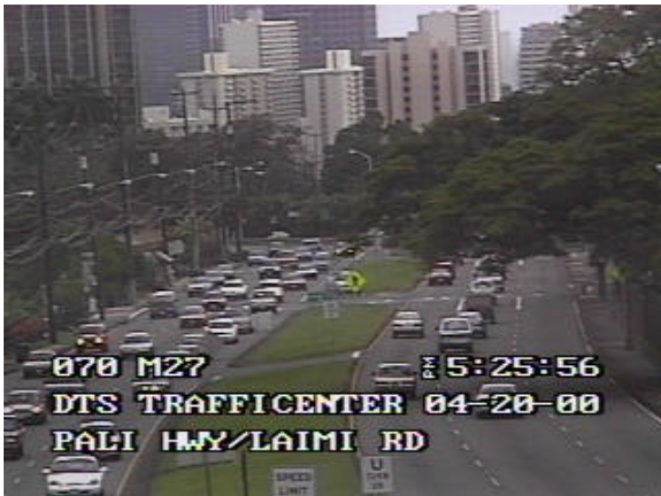
FIGURE 5. An image capture about 6 minutes later shows a typical view of traffic flow by the subject pedestrian crossing.