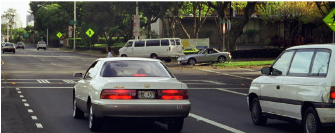
FIGURE 1. Cars stopping for pedestrian crossing while in-pavement lights are flashing.

On March 6, 2000, the Hawaii Department of Transportation (HDOT) activated in-pavement traffic lights system consisting of 24 lights evenly distributed along the edge of the cross walk. Additional elements of the installation included a solar array, batteries, three poles with light-activating push buttons (one at each curb and one on the median) and two custom pedestrian crossing signs containing blinking lights as shown at the right edge of Figure 1.