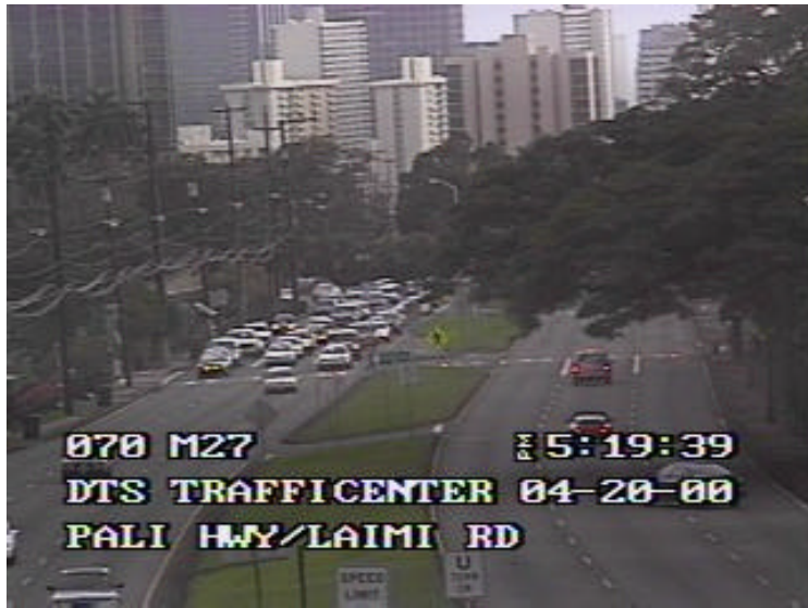
FIGURE 4. Although the in-pavement lights cannot be seen due to distance and CCTV camera location, it is obvious that they caused a large NB platoon to stop for a pedestrian. The pedestrian is about 3 ft. to the right of the stopped car in the fast lane. Also, the brake lights of SB vehicles are on.