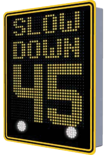
Choice of faceplate colors available. Sign: 42.5"(h) x 31"(w) x 5"(d)