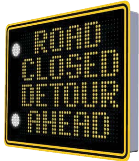
Choice of faceplate colors available. Sign: 42.5"(h) x 31"(w) x 5"(d)