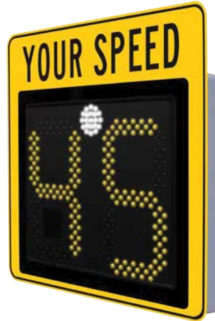
Choice of faceplate colors available. Full Size: 40"(h) x 30"(w) x 3"(d) Compact: 28"(h) x 26"(w) x 3"(d)