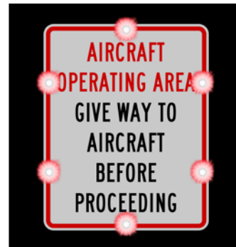
Custom Sign (R-18-XX)