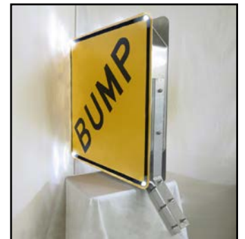
Double sided configuration