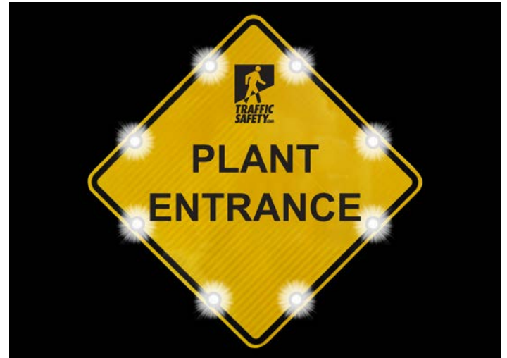
Custom Sign (W-24-XX)