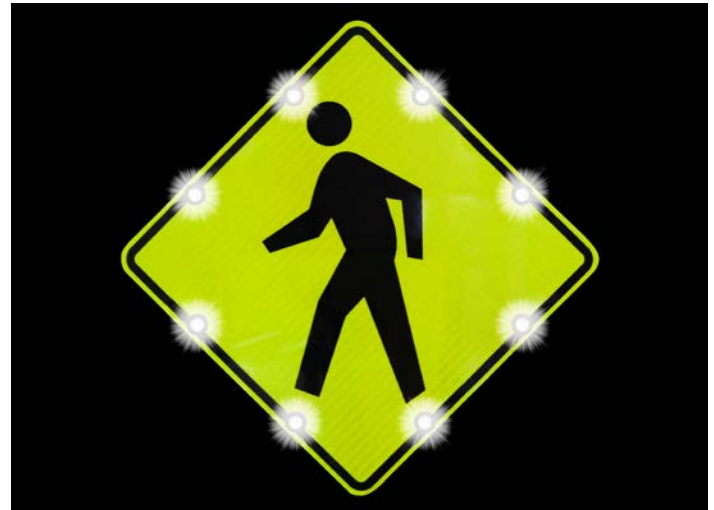
Pedestrian Crossing (W11-2)