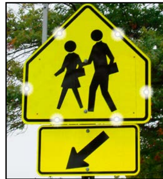
School Crossing (S1-1)