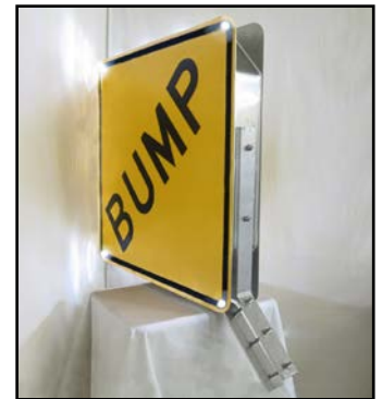
Double sided configuration