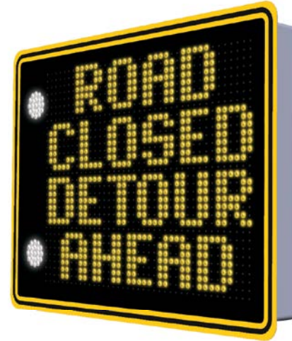
Choice of faceplate colors available.