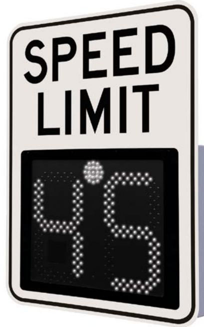
Choice of faceplate colors available.