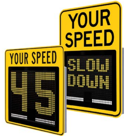
Choice of faceplate colors available.