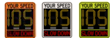
Choice of faceplate colors available.